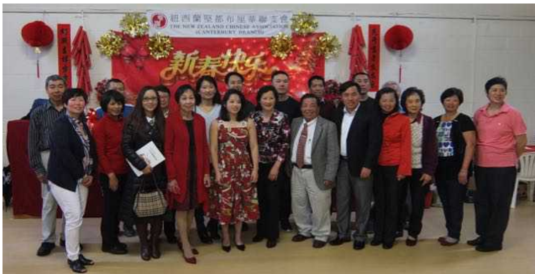
Celebrating Chinese New Year 2017! "Year of the Rooster"

We invite and welcome you as a member to attend and express any matters of interest.