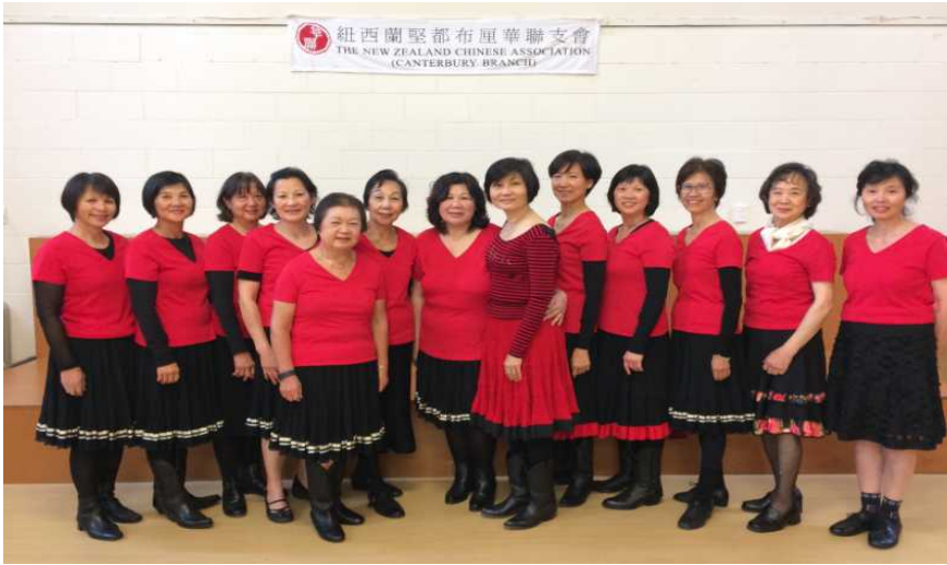
Line dance group