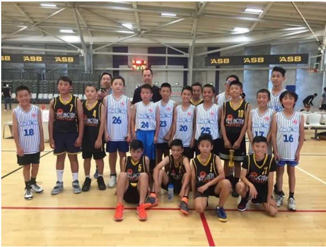
Photo: Intermediate - Auckland (light blue) and Wellington A (black)

Overall, it was a successful tournament for Auckland junior basketball. It was great to see the young players show the results of all their hard work at practice, displaying their skills and teamwork, and continually improving throughout the tournament. For all our young players, competing at the Easter Tournament will be something they remember for a long time. A great foundation has been laid and we are all looking forward to the next tournament!