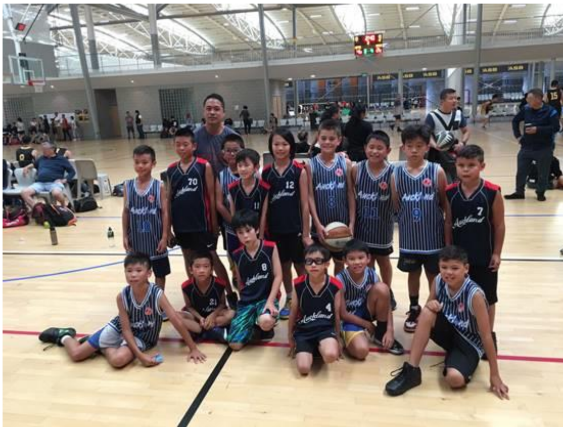
Photo: Miniball - Auckland A (light blue) and Auckland B (dark blue)

The Miniball A team won 4 of their 5 pool games comfortably, with the only loss to Wellington A 58-41. The final against Wellington A started well, with Auckland defending well and taking the lead. Auckland continued their momentum for three-quarters of the game, looking to extend their lead, but couldn't quite shake off Wellington, who was holding on. In the 4 th quarter, Wellington lifted their intensity, caught up and took the lead. Auckland lifted and came back, but couldn't quite snatch it near the end, with Wellington holding on for the win 30-27. A great final and an excellent effort from the Auckland team who can hold their heads high.