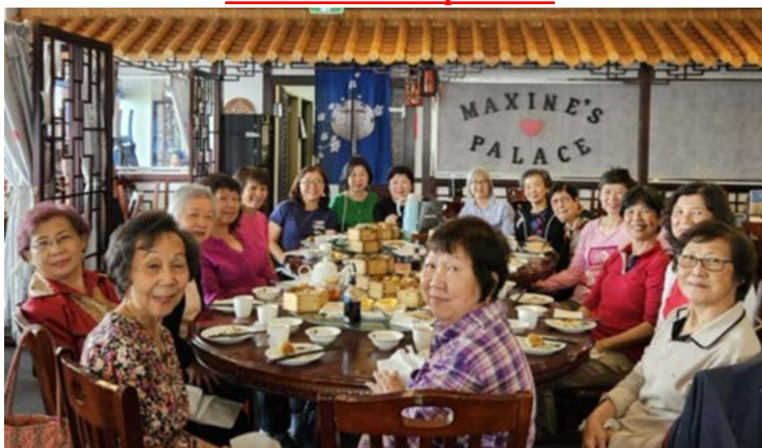
Xmas 2023 yum cha lunch