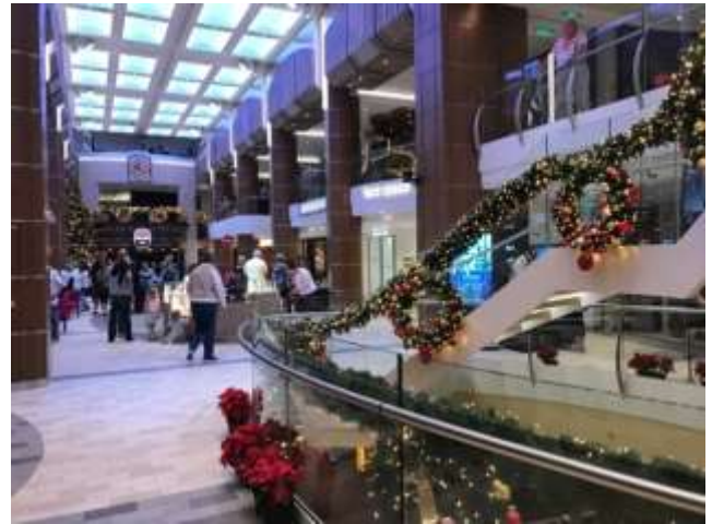
The Royal Esplanade

SHOWS There were 3 stage productions. These were not plays but are sound and light shows with singing and dancing. These had to be the most dynamic shows we have ever seen anywhere. It was awe inspiring and one left the theatre in wonderment. There were other shows such as a solo male vocalist, juggler/comedian etc. all world class. Royal Caribbean is tops in entertainment and is a hard act to follow. It has been said that shows on board are better than those on land.