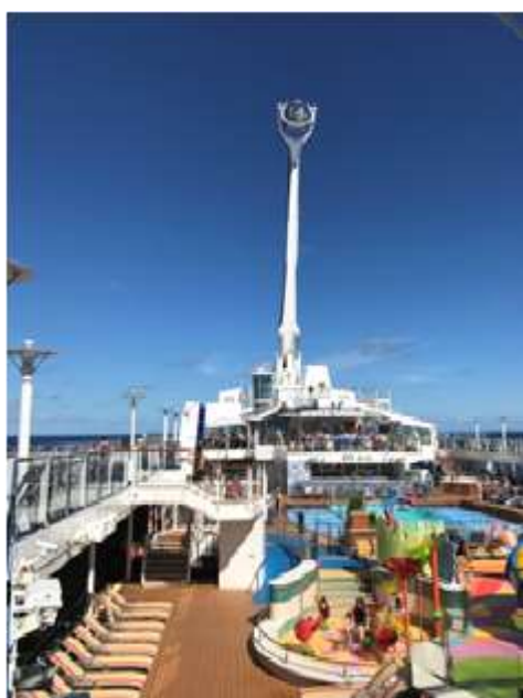
The North Star Capsule

OVERVIEW We had 2 adult grandchildren with us in our sub group, and they wore themselves out by doing all the activities from dawn till dusk, mainly surfing. They also did mountain running in most of the ports we stopped at. They ate like horses, so they got our money's worth. We did invite our other grandchildren but they were unavailable due to work or study. Pity, they would have had a blast. It is not easy to make an appointment with the grand children after they have grown up. We had 2 other friends in our sub group. Occasionally we would bump into Clarence & Judy and sometimes Tony and Maria. Everyone did their own thing