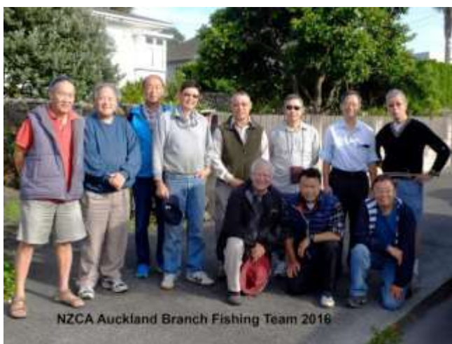
The Auckland team;