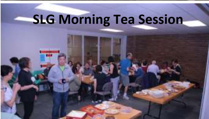
SLG Morning Tea Session