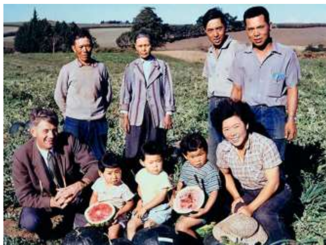
A photographic journey'

Explore the dynamic stories of Chinese life in New Zealand in Being Chinese in Aotearoa: A photographic journey , a new exhibition celebrating 175-years of Chinese New Zealanders.