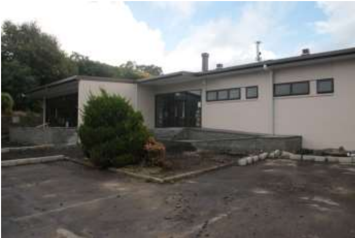
Mangere Hall progress 17/02/2017