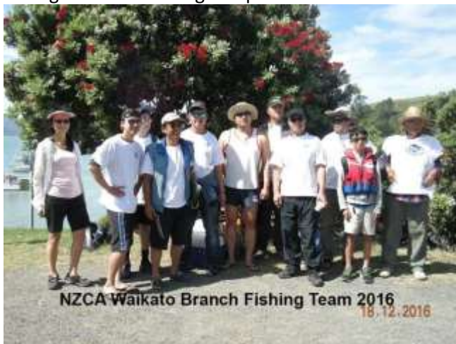
The Waikato team;

On December 18 th 2016, The NZCA Auckland Branch Fishing team was invited by the NZCA Waikato Branch fishing team to a fishing competition.