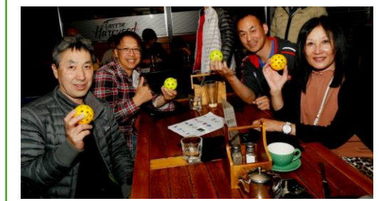
A social night out at Tavern Harewood on Friday 22 November 2024.