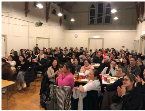
NZCA Auckland Trivia Night Saturday, 3rd August 2024

Held once again at Mt Eden Village Centre on Saturday, 3rd August we were sold out early July so if you don't want to miss out and ensure you are emailed about our next Trivia Night please click here to register your contact details.