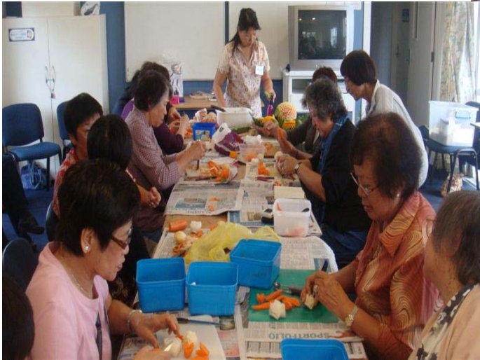
Busy people – Vege carving :