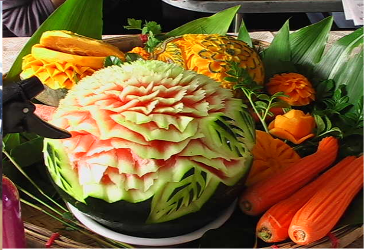
Inticate finished carvings: