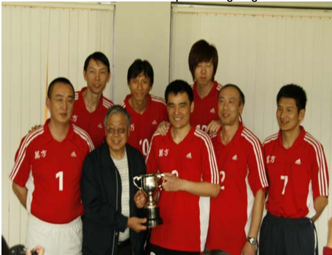
Men's Final 2008 Champs – Wangfang