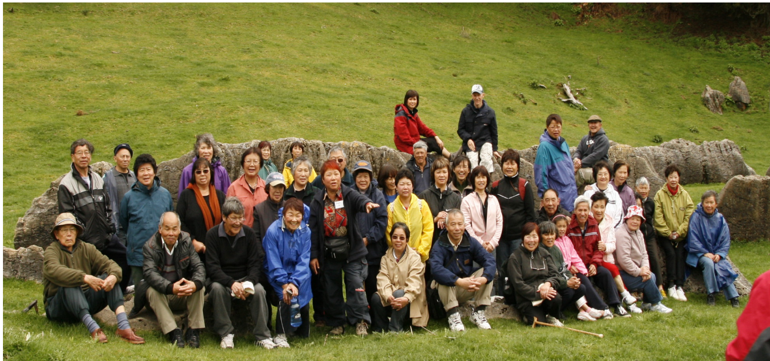
NZCA Waitomo Trip. Oct.2008

P.O.BOX 484 AUCKLAND Newsletter: NOVEMBER 2008