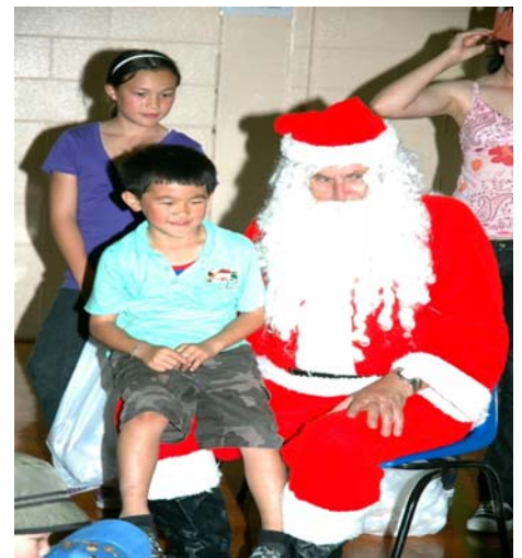
Make a wish with SANTA !