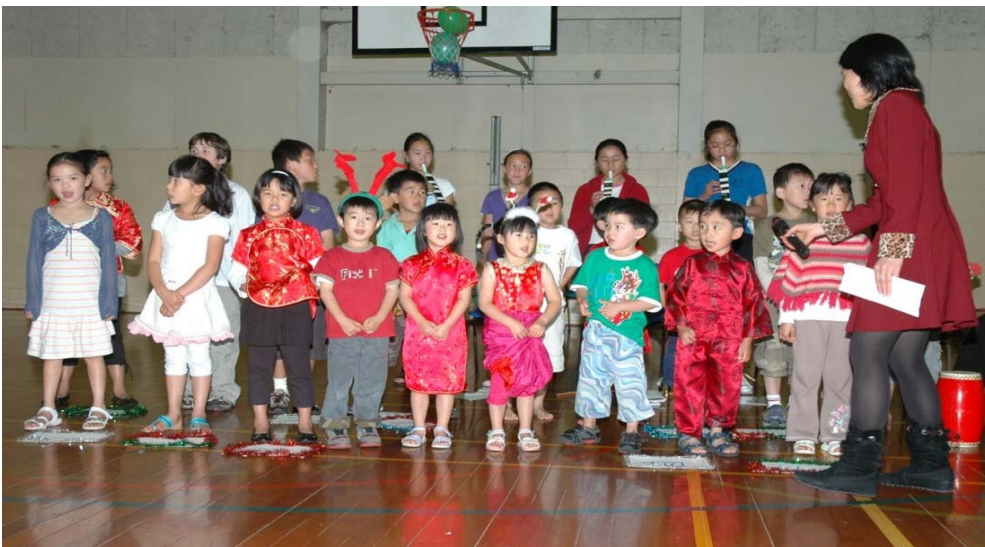
NZCA Chinese Bilingual Language Music School performance at Xmas BBQ..