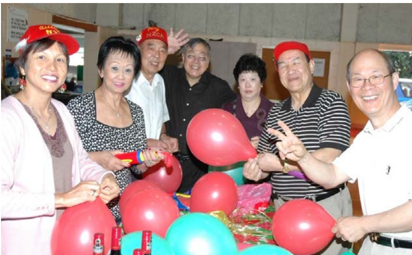
NZCA Members preparing for Xmas Party Time 2007