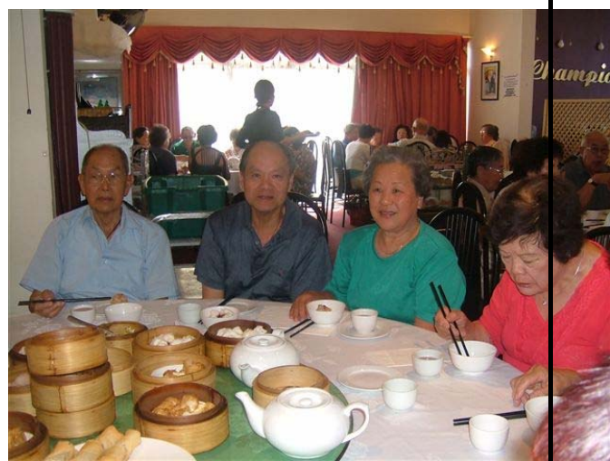
Contented Senior members enjoying the 'Seniors YUMCHA ' at KK Restaurant