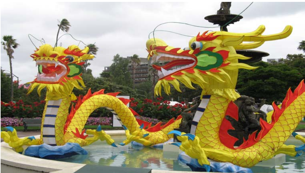
DRAGON Lanterns displayed @ Albert Park Lantern Festival – FEB 2008