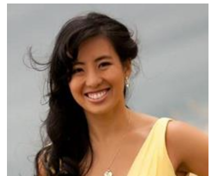
MAY LOW VP MEMBERSHIP