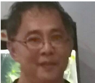
KEWWA LOW PROPERTY